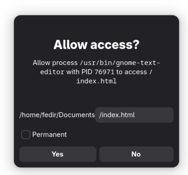
Figure 3.1: ICFS Access Dialogue: Displays the process executable name, PID, and target file path. Users may adjust the file scope, toggle permanent permissions, or grant/deny access.

When a process requests access (e.g., open, modify, delete) to a file without preexisting permissions, ICFS generates an access dialogue (see Figure 3.1).